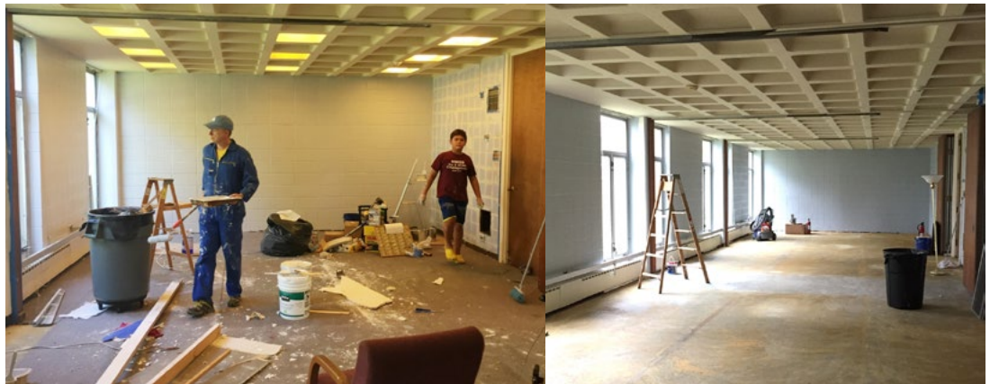
Before and After!

Progress on the space rehab is being made: painting the walls, ripping out the carpet, and cleaning the air vents.